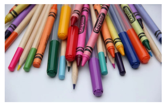
Youth Art Month happens every March! Save the Date! Community Art Auction March 27th

Homecoming week was extra special this year. Trumansburg Central School District has its own Varsity football team for the first time since 2014. The decision to merge teams with South Seneca and Trumansburg started in 2015. Three schools merged because Trumansburg, Romulus, and South Seneca were too small to each have their own team. Now, Trumansburg Football is back! Homecoming week consisted of a spirit week full of interesting dress up days. Monday was America day; Tuesday was twin day; Wednesday was color wars; Thursday was blue and gold day; and Friday was Hawaiian shirt day. On Wednesday, color wars day, the freshman (continued on page 3)